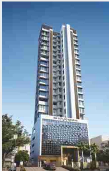
AARADHYA SIGNATURE, SION ●