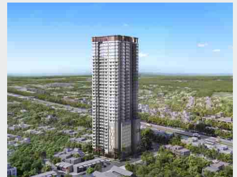
AARADHYA EASTWIND, VIKHROLI ●