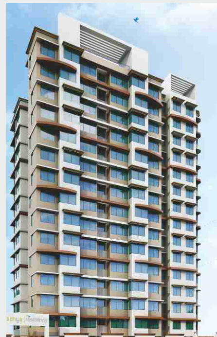
AARADHYA RESIDENCY, GHATKOPAR ●