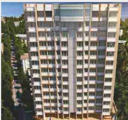
AARADHYA ONE, CHEMBUR ●