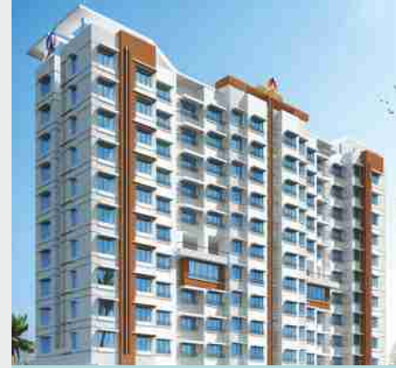
AARADHYA TOWER, GHATKOPAR ●