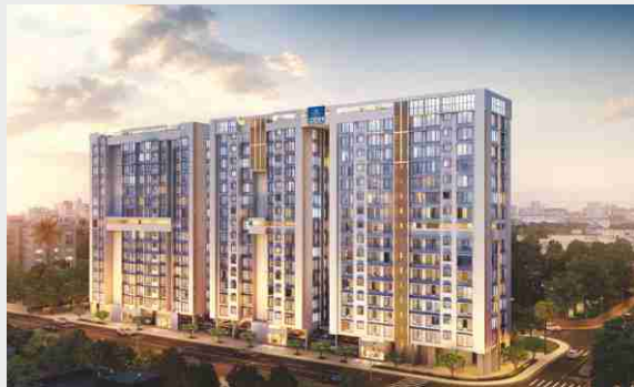
AARADHYA NINE, GHATKOPAR ●