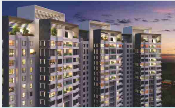
ATMOSPHERE, MULUND ●