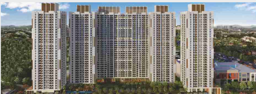
AARADHYA HIGHPARK, DAHISAR ●