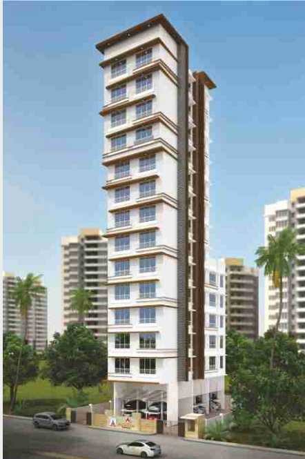
AARADHYA SAPHALYA, GHATKOPAR ●