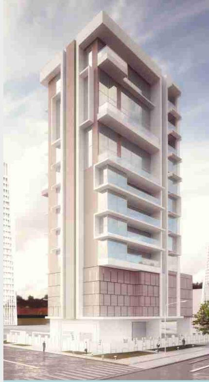
AARADHYA SWASTIK, CHEMBUR ●