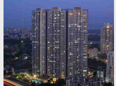
ATMOSPHERE PHASE 2, MULUND ●