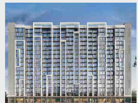
AARADHYA ONE EARTH, GHATKOPAR ●